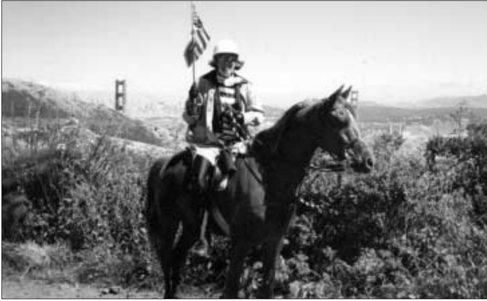
United We Stand - United We Ride! Golden Gate Bridge & San Francisco viewed from Marin's GGNRA.