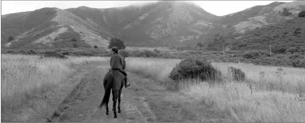
Marin County's Rodeo Valley trail in the Golden Gate National Recreation Area

415-383-6283 • FAX 415-381-3809 • e-mail BABTT@earthlink.net • www.bayareabarnsandtrails.org