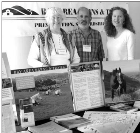
The Bay Area Barns & Trails booth at the 2007 BAOSC Annual Conference.