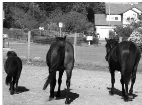
Images from BABTT's membership gift. 6 beautiful photo-cards displaying horses in areas bordering development by photographer, and horseowner, Aviva Rossi. Your gift when joining at the $100 level or above!