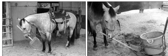
Being resourceful with self-directed "Stewardship"!

The 'Resource' recently moved to the Kentucky Horse Park where it will continue to expand partnerships with many other equine-focused organizations. - www.elcr.org