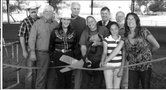
Ribbon cutting at Robertson Arena